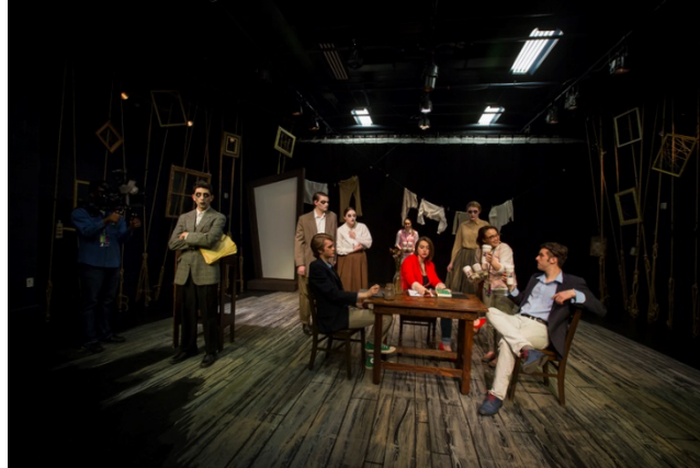
Fig. 2: The reality TV producers offer the Samsa's a contract.

With a plot mapped out and dialogue written (actually quite over-written in the first draft), we could return our focus to how the non-text elements might carry the narrative. With mentoring from design faculty and constant access to our performance space, our student designers were able to design and construct a set and rough-in the light and sound design weeks before our first performance. The advantage of having all designers present as we rehearsed cannot be overstated, as they were as much creators of the narrative as the playwrights.