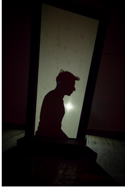
Fig. 6: A silhouette of The Author (Kafka) in A Metamorphosis.

We again used a silhouette behind the door in Act 1 when the Father and Gregor have a physical confrontation. As their Moment Work advisor, I instructed the class to question how this silhouette vocabulary could literally “grow.” Recalling their prior experiments with lights and shadows during the Moment Work process, the students decided to create a climactic Moment in which Gregor as symbolic Other would appear as a silhouette that filled the entire back wall.