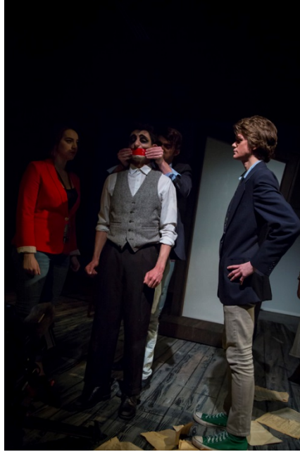
Fig. 5: The use of props and color to convey narrative in A Metamorphosis .

The students found a wide roll of red duct tape, which made the Moment even stronger due to its color. The props designer describes this theatrical discovery 3 :